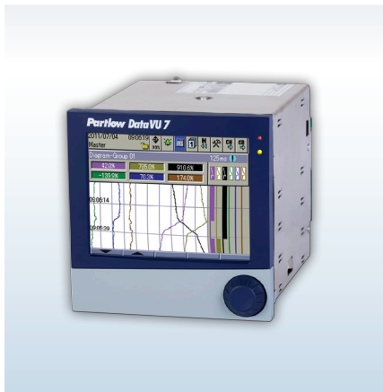
Chart recorders, thyristors and sensors